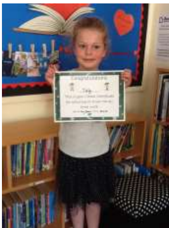
pirate merits and they've written pirate poems, made treasure maps and enjoyed the Lincolnshire Show online!