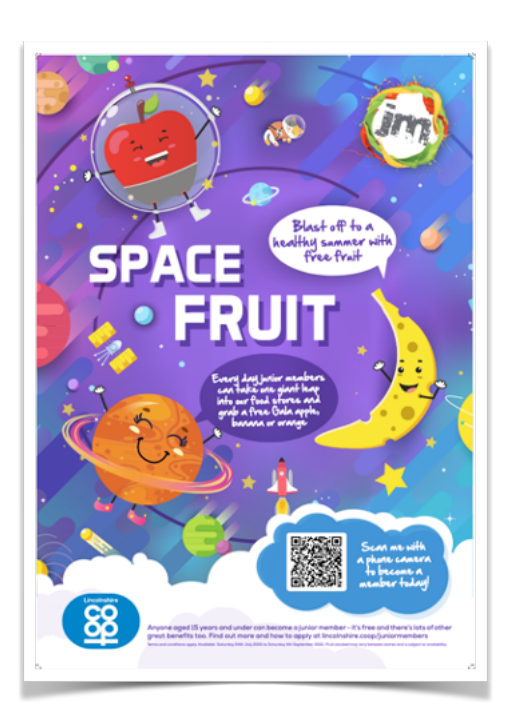
Blast off to a healthy summer with free fruit!