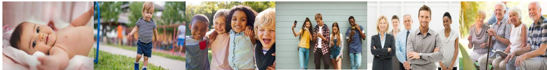
baby toddler child teenager adult elderly

Some adult animals, such as mammals, give birth to live young which look like them.