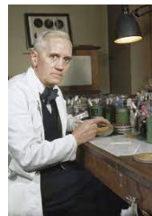
Alexander Fleming 1881-1955 - discovered the antibiotic, penicillin.