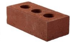
never been alive