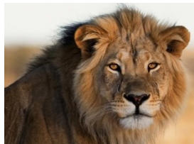
el león, the lion