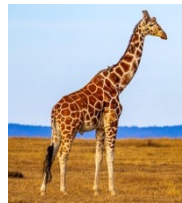
la jirafa the giraffe