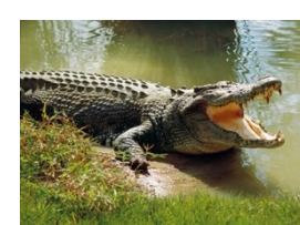
el cocodrilo the crocodile