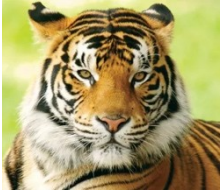
el tigre the tiger