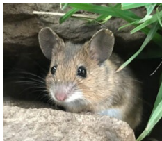
el ratón the mouse