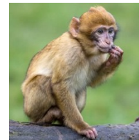
el mono the monkey