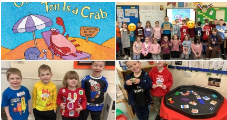
Parents visit Year 2!