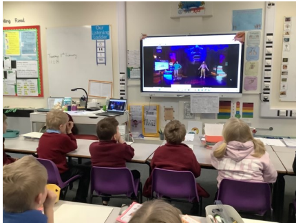
Safer internet day!